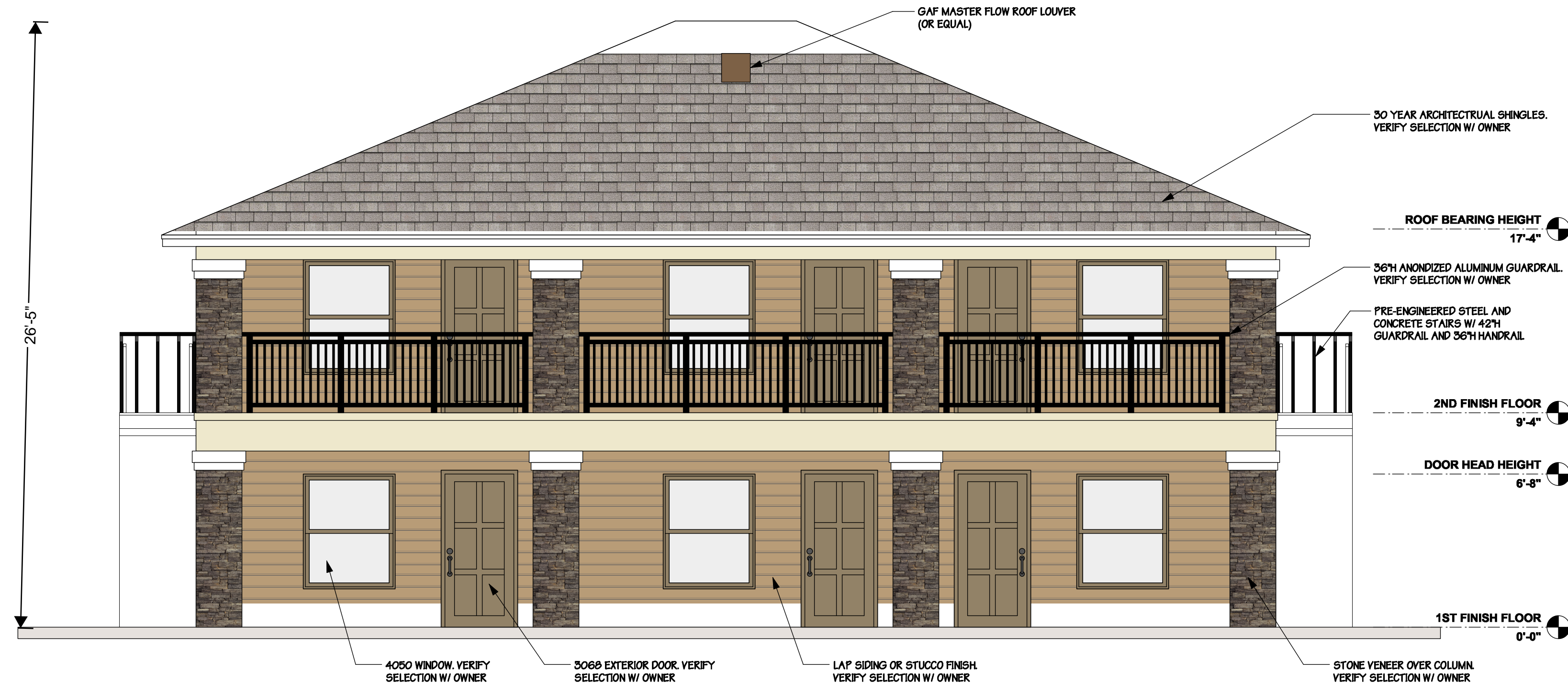
1 South Elevation Scale: 1/4" = 1'-0"