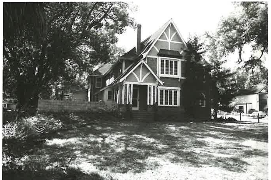
* Arched windows