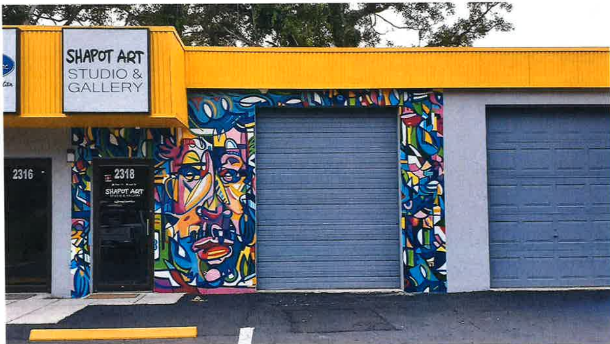
The Mural on the outside of my studio (Shapot Art Studio and Gallery)