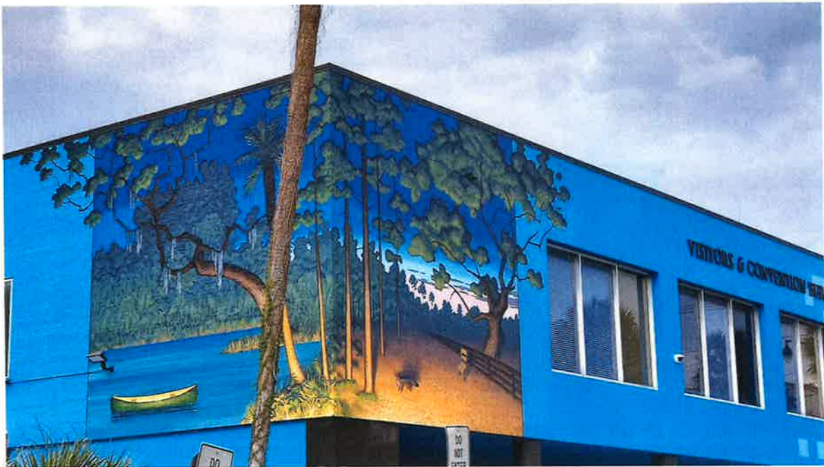
The mural I assisted with on the Marion County Visitors and Convention Bureau building