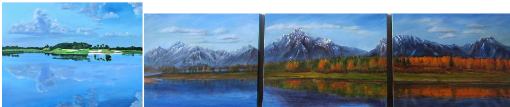
Exhibit A- Artwork Waterscapes/ June 22, 2026- December 22, 2026