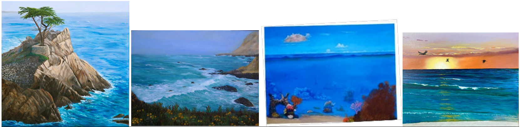
Exhibit A- Artwork Waterscapes/ June 22, 2026- December 22, 2026