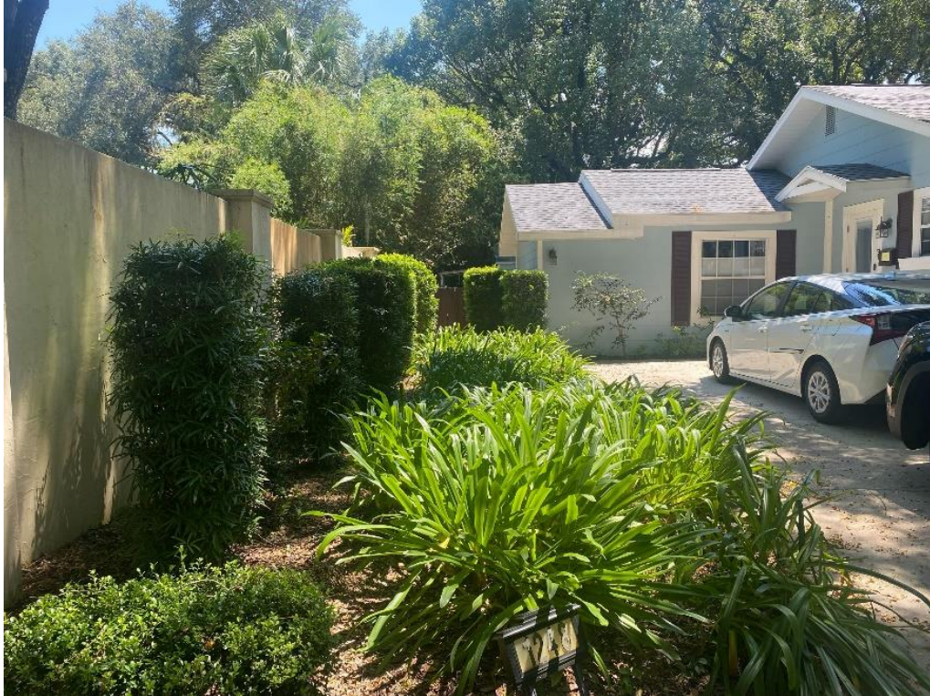
Eastern side yard and view of wooden gate to be replaced, facing south onto subject property.