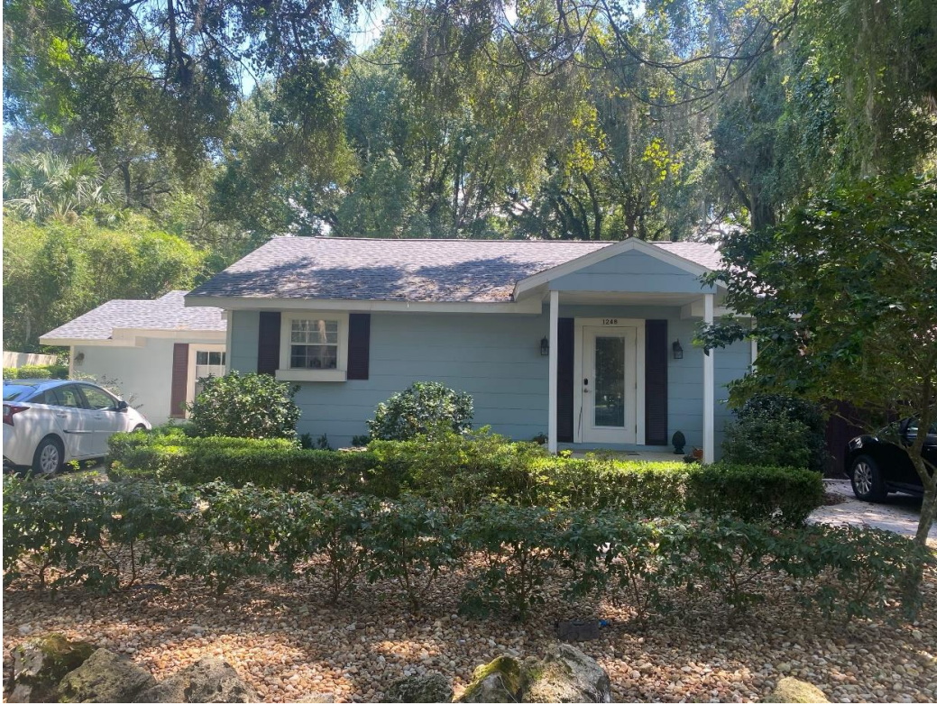
1248 SE 3 rd Street, facing south onto subject property.