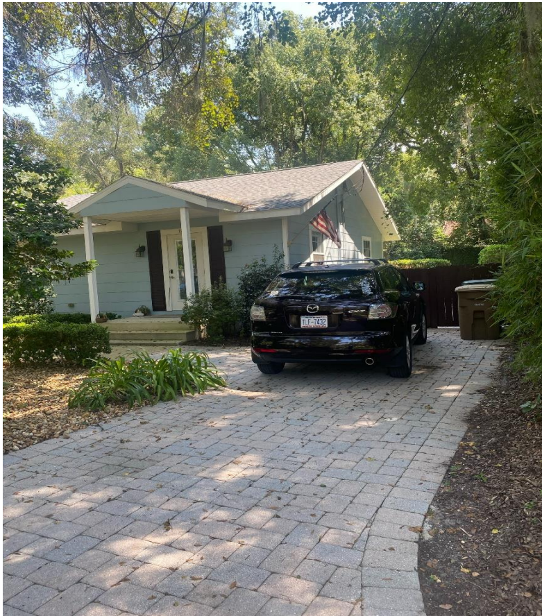
Western side yard and view of wooden gate to be replaced, facing south onto subject property.