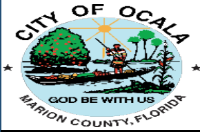
Exhibit B - PRICE PROPOSAL