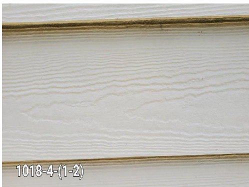
1018-4 Siding/Gray Typical Exterior Walls