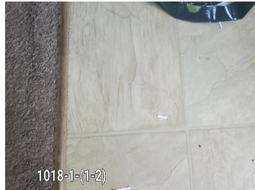
1018-1 Rolled Flooring/Cream, Adhesive/Yellow Interior Floors (200 sq. ft.)