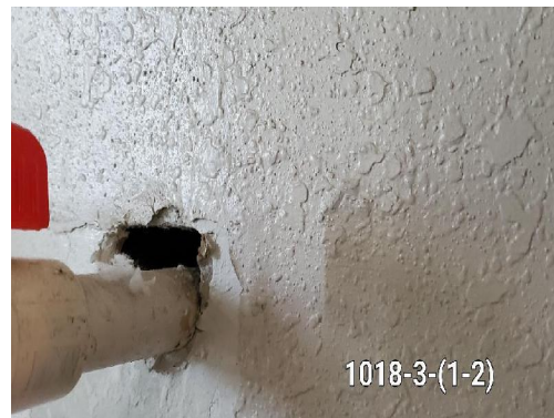
1018-3 Drywall/Joint Compound/White Typical Interior Walls/Ceilings