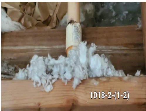
1018-2 Insulation/White Typical Interior