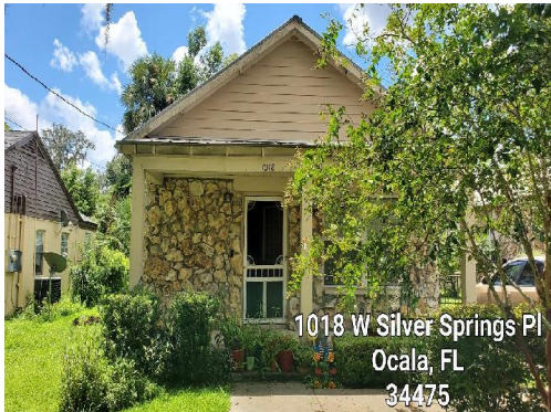
1018 W Silver Springs Place Ocala, FL 34475