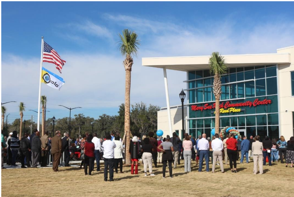
Mary Sure Rich Community Center at Reed Place, 1812 NW 21st Ave.

Ribbon cutting ceremony, Tuesday, January 10, 2023.