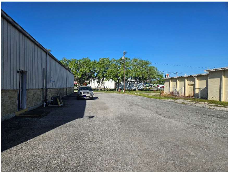
Image 2. Existing parking lot.