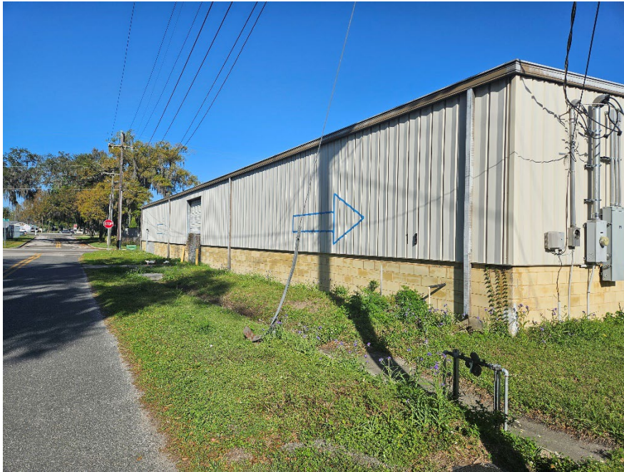
Image 1. Building facade along NW 9 th St.