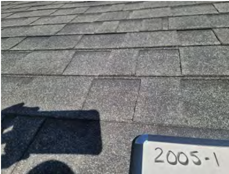
2005-1 Asphalt Shingle/Tar Typical Exterior Roof