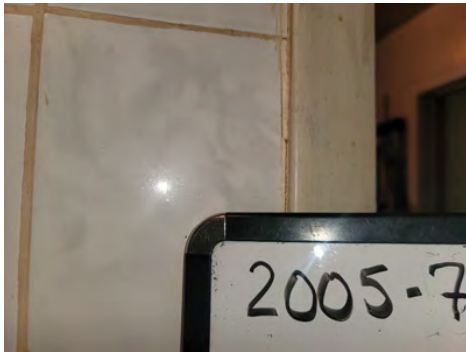
2005-7 Caulk Typical Interior Doors, Windows