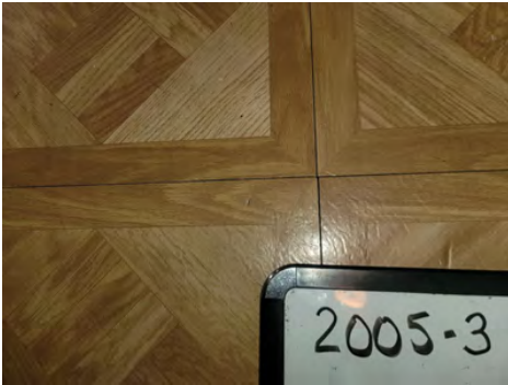
2005-3 12"x12" Vinyl Floor Tile/Adhesive Interior Living Room