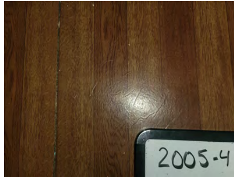
2005-4 12"x12" Vinyl Floor Tile/Adhesive Interior NW Bedroom, NE Bedroom