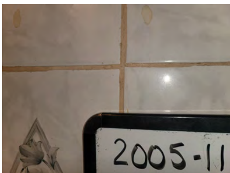
2005-11 Grout Interior Bathroom Wall Tile