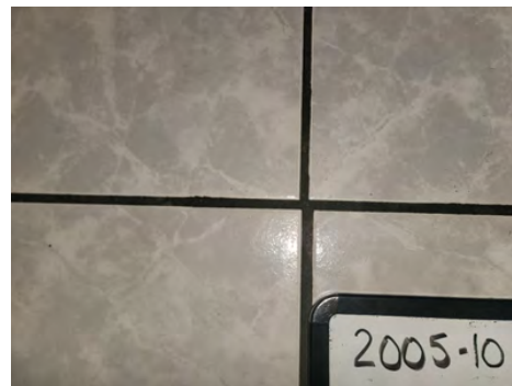
2005-10 Grout Interior Bathroom Floor Tile