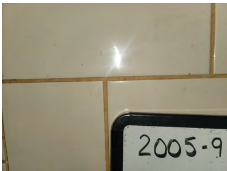
2005-9 Grout Interior Kitchen Wall Tile