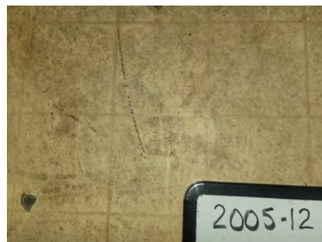
2005-12 Rolled Vinyl Flooring/Adhesive Interior Laundry Room