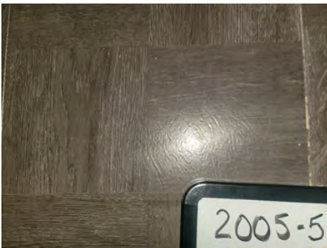
2005-5 12"x12" Vinyl Floor Tile/Adhesive Interior SW Bedroom