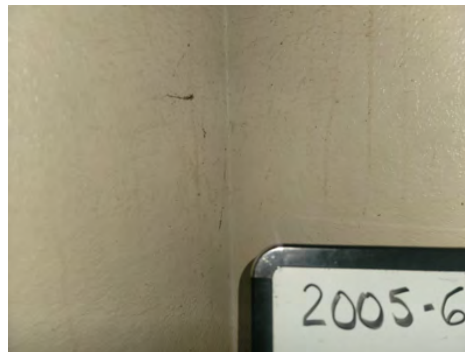
2005-6 Joint Compound/Drywall Typical Interior Walls, Ceilings