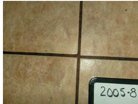
2005-8 Ceramic Floor Tile/Grout Interior Kitchen