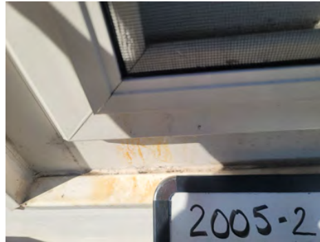
2005-2 Caulk Typical Exterior Windows