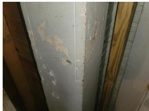
Hallway(005) A-Wall, Center Wood Door Jamb, Casing Lead-Positive, Deteriorated