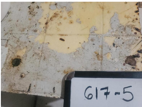
617-5 Vinyl Countertop Interior Kitchen Cabinet