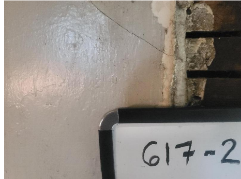
617-2 Plaster/Skim Coat/Rough Coat Typical Interior Walls/Ceilings