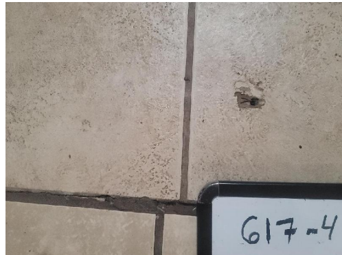
617-4 Grout Typical Interior Tile Flooring