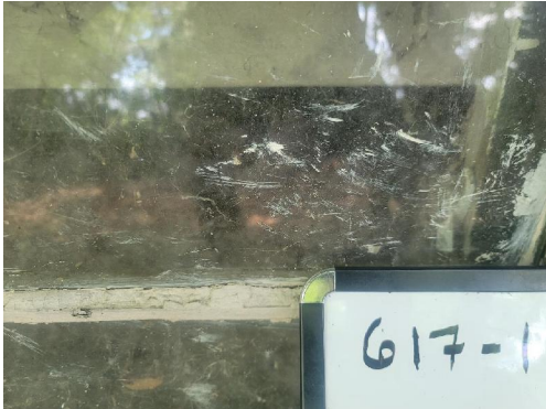
617-1 Glazing Typical Exterior Windows