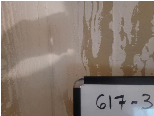
617-3 Joint Compound/Drywall Interior Front Bathroom Walls/Ceiling