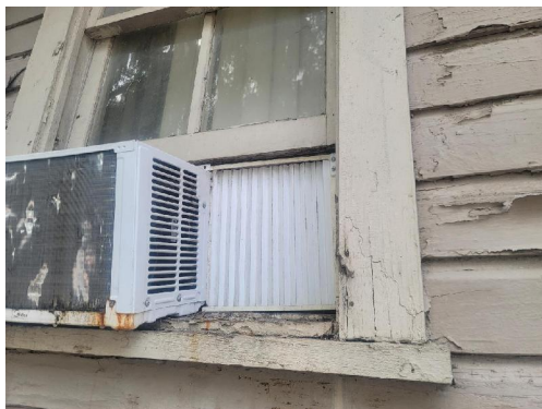
Exterior(001) D-Wall, Center Wood Window Components Lead-Positive, Deteriorated