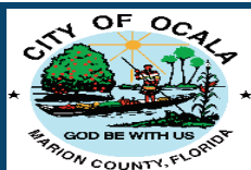
Exhibit B - PRICE PROPOSAL